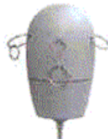
Teen Sexual and Reproductive Health