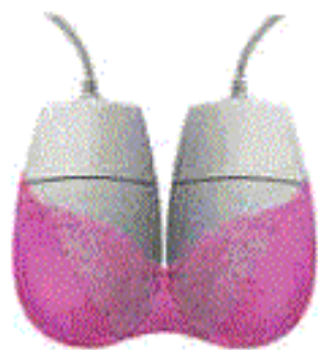
Women's Sexual Health