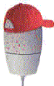
Adolescent Sexual and Reproductive Health