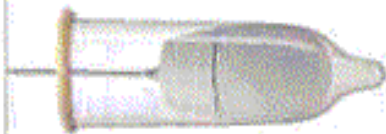
Sexually Transmitted Infections